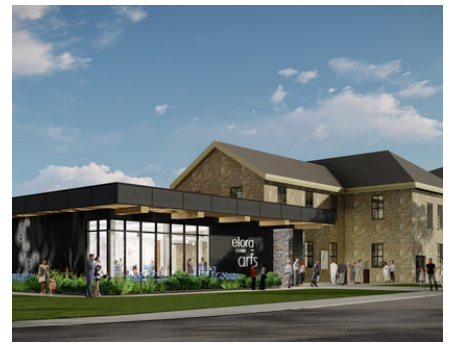
A rendering of the planned 3,500-sq-foot addition to the Elora Centre for the Arts